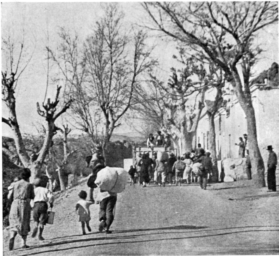
They passed by the villages along the road.