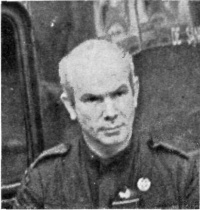
Dr. Bethune, chief of the sanitary expedition