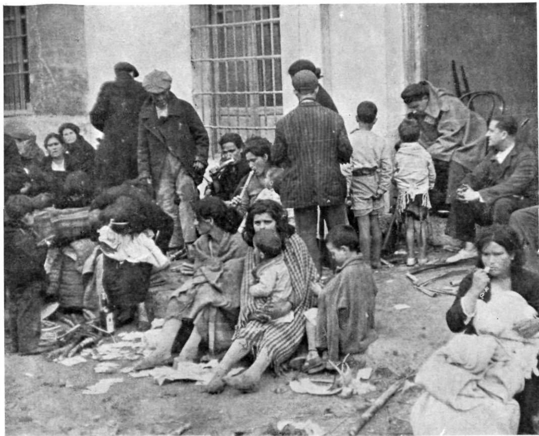
Sugar cane their only sustenance.