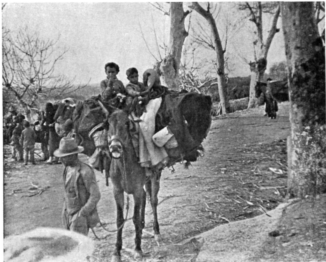
Malaga people sadly leave their home town, carrying with them the'r children and their household goods.