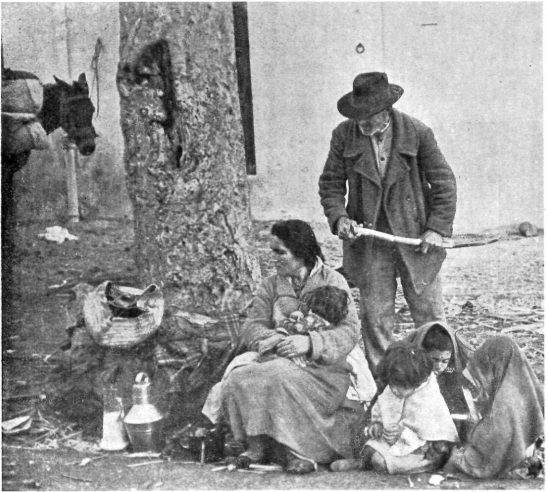
Exhausted by flight family halts for rest.