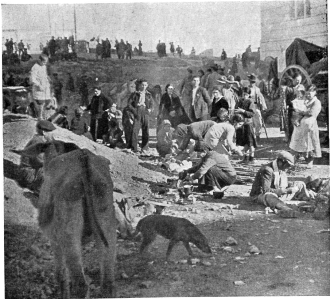
The endless procession takes a rest by the roadside.