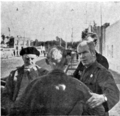
Dialogue in the streets of Almeria

tionate admiration, in the memories of all the honourable consciences in the world. It is not a question of some combatants: it is a question of three personalities of the highest moral calibre, who possess above everything else a deep and austere feeling of sacrifice for their kind. The descriptions which are published in this pamphlet are from the honoured pen of the eminent Dr. Norman Bethune, on the subject of the terrible march undertaken by the Spaniards of the city of Malaga, the frightened exodus of a whole town, who preferred death a thousand times rather than submit to the criminal tyranny of fascism. Dr. Bethune, with his just and impartial words, will denounce before the world the crime committed—one more and one of the most monstrous—against the Spanish people by the foreign hordes which are fighting to subjugate them under the black tyranny of fascist barbarism.