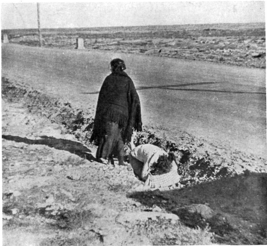
Hardly able to struggle on.