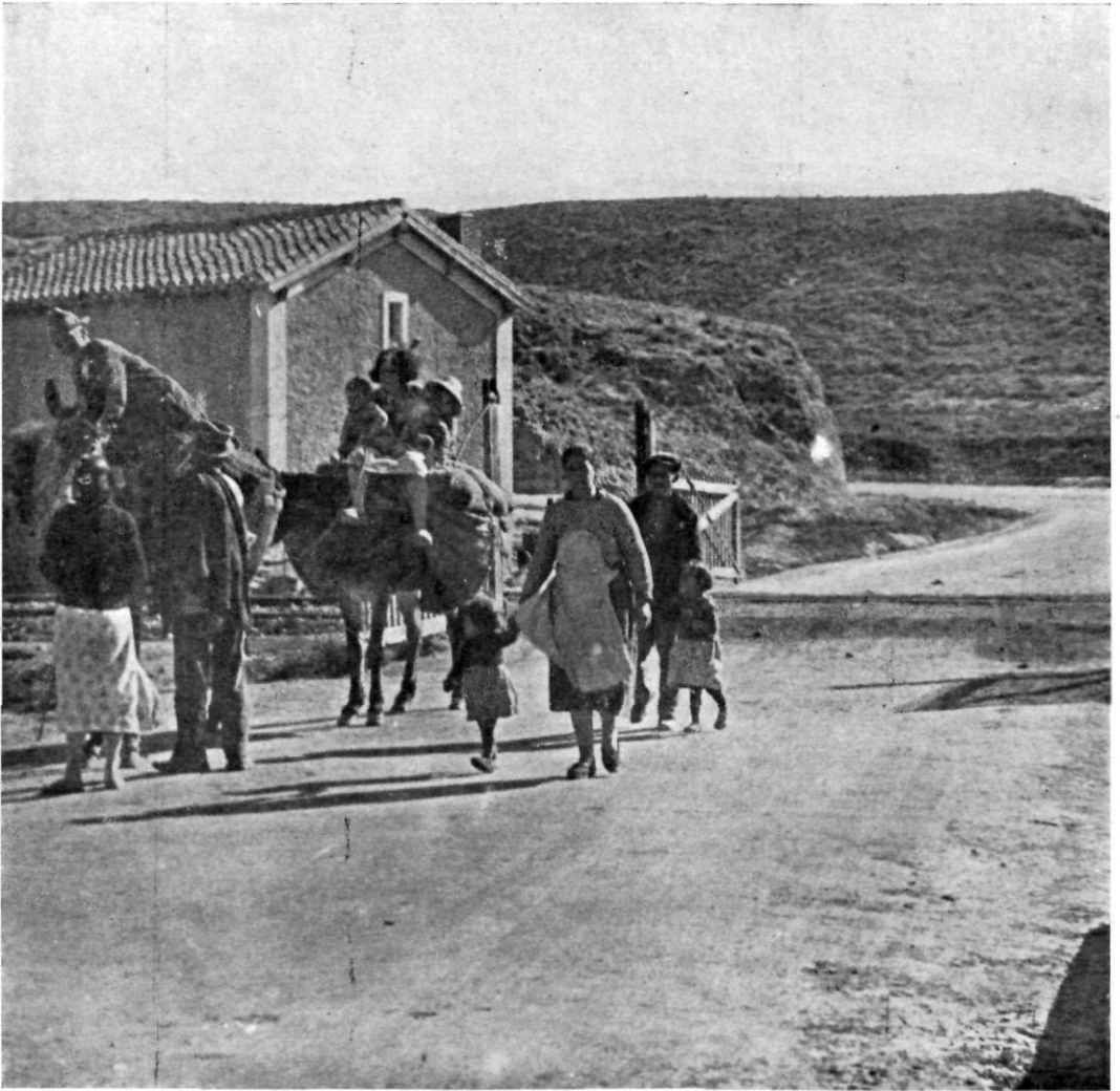
Even children must tramp along.