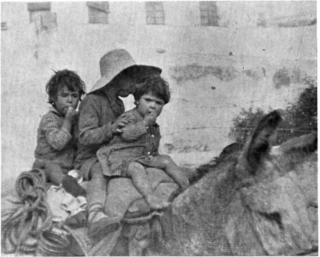
Tiny victims flee for safety.