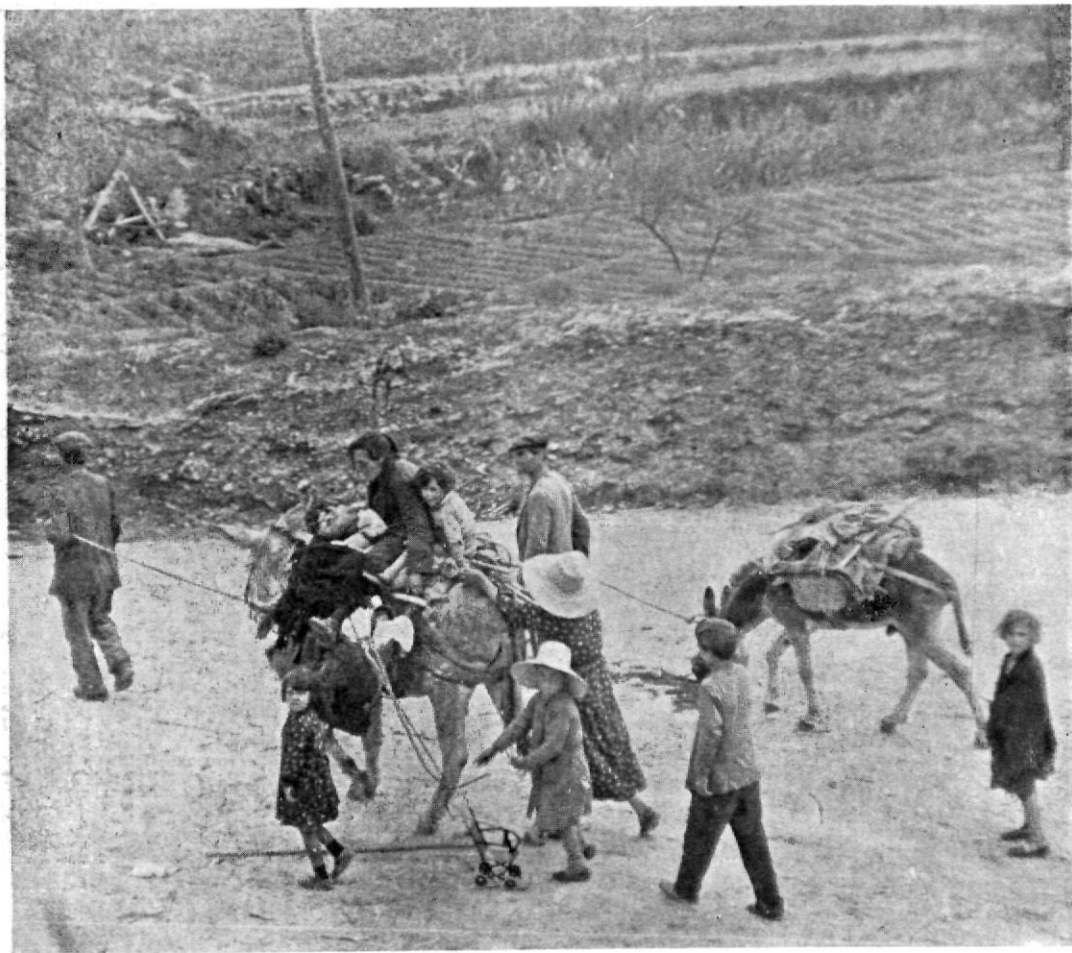
The children rescue what toys they can.