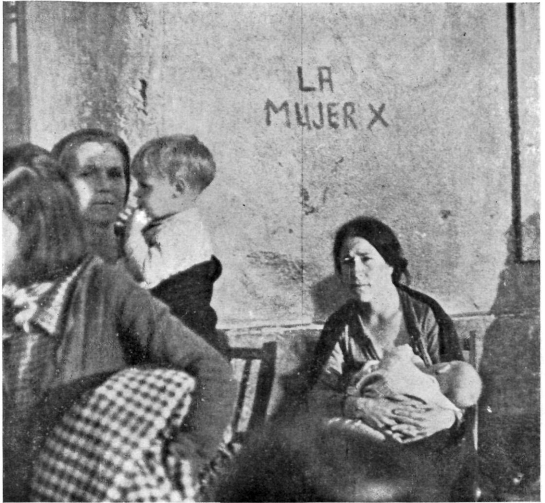
A brief respite in a roadside cottage.