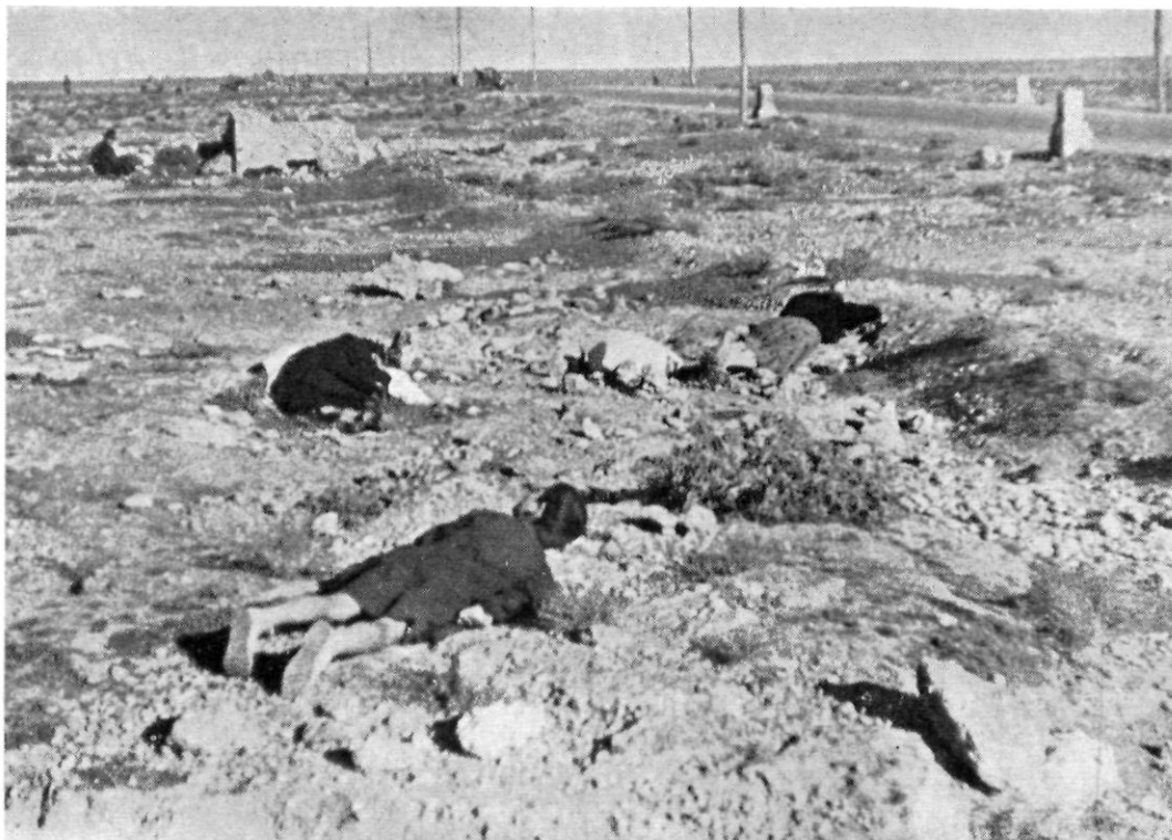
Collapsed along the length of the route.