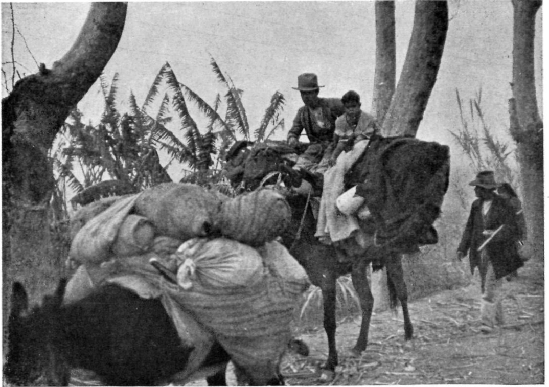
The trek to safety still goes on.