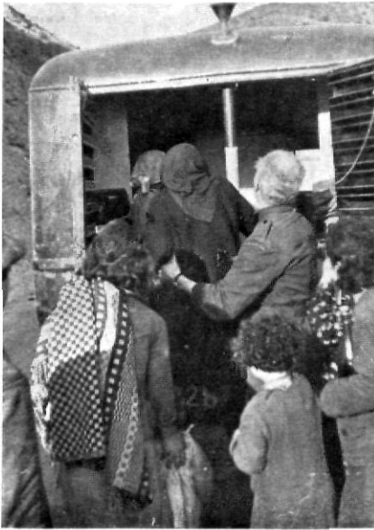
Helping the refugees to get into the ambulance

planes, the multitude continued their hasty march, their career of desperation and infinite anguish. Their goal was still very distant and they had no means of shortening it.