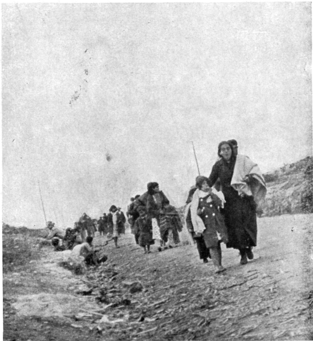
The endless procession.